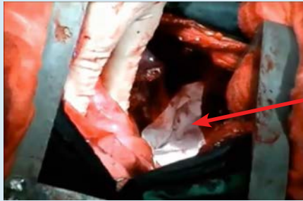
BloodSTOP iX Used in Thoracic Surgery

When applied on a surgical wound, BloodSTOP® iX quickly absorbs blood and exudates, transforms into a gel to seal the wound with a protective transparent layer, acts fast to control bleeding, and creates an environment for wound healing. The clear gel facilitates monitoring of hemostasis.