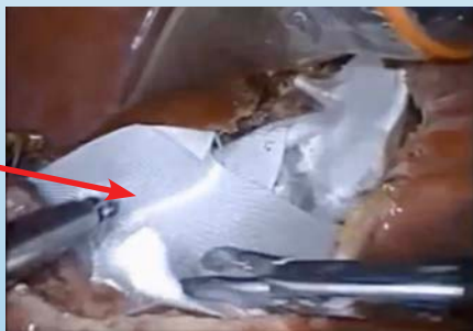
BloodSTOP iX Used in Laparoscopic Cyst Reduction Surgery

BloodSTOP® iX Absorbable Hemostat and WoundHEAL® is used for surgical procedures to quickly control capillary, venous, and small arterial hemorrhage. It can be used in neurosurgery, cardiovascular surgery, general surgery, thoracic surgery, gynecologic surgery, urologic surgery, and burn & trauma surgery.