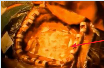
BloodSTOP iX Used in Intracranial Surgery